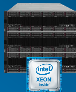
Intel® Xeon® Processor E7-8880 v3