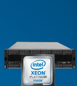
2nd Gen Intel® Xeon® Platinum 8260 Processor